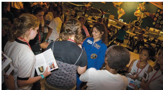
A group of girls gathered around keynote speaker Anousheh Ansari for questions and autographs.