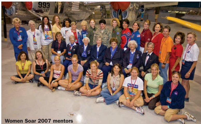
Women Soar 2007 mentors

By midday, it was time for the formal program to end, and the informal program to begin: exploring EAA AirVenture. Each girl was given a wristband and encouraged to check out everything AirVenture has to offer, including the air show, exhibit booths, AeroShell Square, and other aircraft areas. Afterward, they could see the Beach Boys in concert and attend the space-themed Theater in